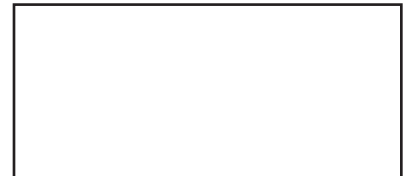
Clinic Stamp, if given at a clinic